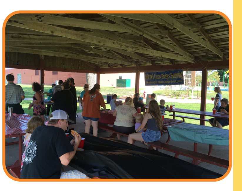
Fun was had by all at our family picnic in the park!