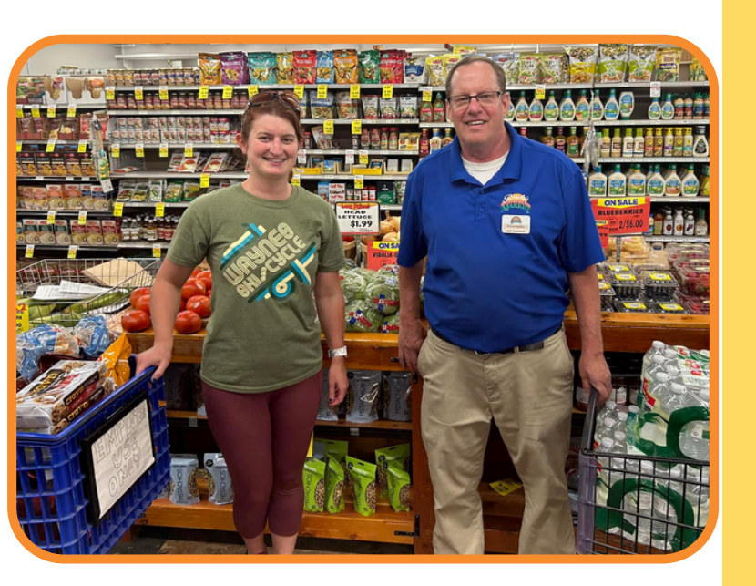
The picnic meal was made possible thanks to the Our Family Cares program and Randy's Neighborhood Market