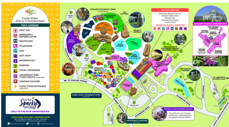
Como Park Zoo and Conservatory map

Matches, we are excited to travel with you on June 3rd. Don't forget to bring a sack lunch.