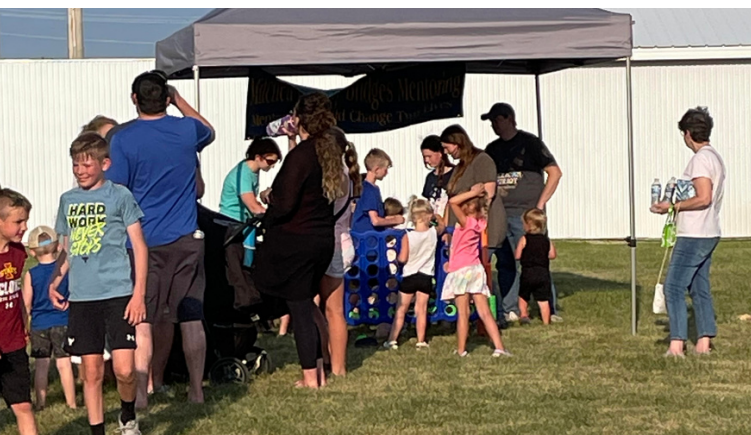
Bridges Mentoring Program's kids activity booth at Friday Night Out.